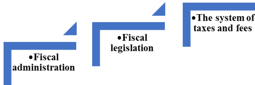
Figure 1. The main components of the tax system

By the fiscal system is meant a unique strategy of the financial system that includes the following important components as represented in the figure 1.